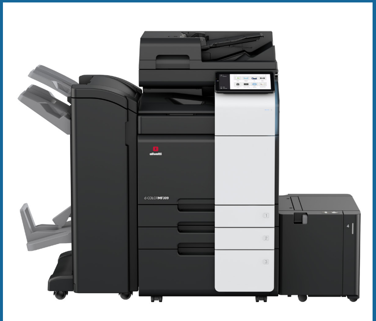
d-Color MF309 with DF-714+PC-416+LU-302+RU-513+FS-536SD

New 10.1" multi-touch operator panel, which can vibrate to provide greater touch sensitivity